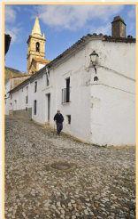
Huelva et Séville Pages 126-137