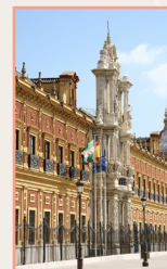
Parque María Luisa Pages 96-103