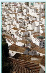
Cadix et Málaga Pages 162-187