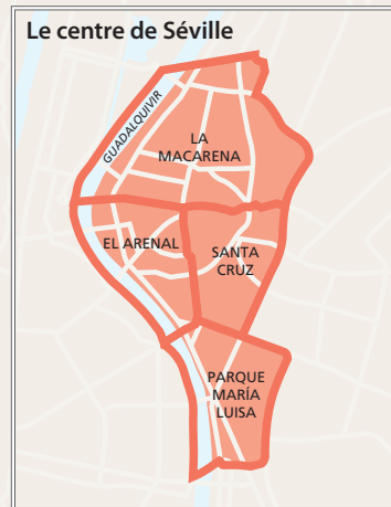
Le centre de Séville