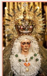
La Macarena Pages 88-95