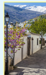
Granade et Almería Pages 188-209