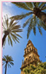
Cordoue et Jaén Pages 138-161